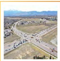
SH 21/Research Overpass CDOT Reg 2