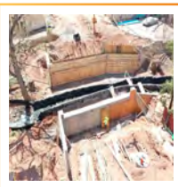
Beckers Ln City of Manitou Springs