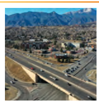
I-25 Fillmore to Garden of the Gods CDOT Reg 2