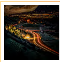
30th St. Reconstruction City of Colorado Springs